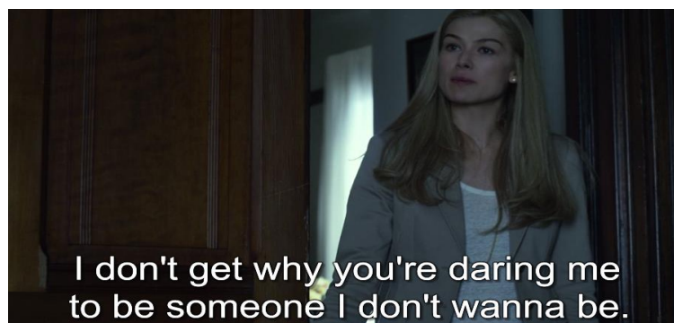
Figure 1. (Social conflict between Amy and Nick)

Figure 1 shows the scene when Amy and Nick were arguing in the living room. In that situation they were blamed each other. This type of conflict classified as the external conflict which is social conflict, as this case conflict between Amy versus Nick. Nick thinks that he had the right to buy anything that he wanted using Amy's money, but according to Amy she asked Nick to find the solution to solve their money problems in that moment, instead of just spent the rest of them to buy useless stuff. The picture above also supported with the following dialogue.