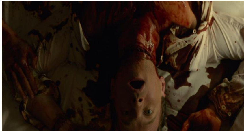
Figure 6. (Physical conflict between Amy and Desi) Source: Gone Girl Movie

The picture above shows the scene when Amy killed Desi Collings in Desi's Lake house. Desi was very shocked when he knew that Amy wants to kill him, but he cannot do anything again to help himself because Amy already prepared all of the things to complete her mission. Amy already put a knife under the pillow in Desi's room, because Amy knew that Desi really infatuated with her, she invited Desi to have sex with her. While they have a sex Amy suddenly wafted the knife to Desi's neck. Not long after that Desi died. Below is the dialogue that supported the picture above, before Amy killed Desi.