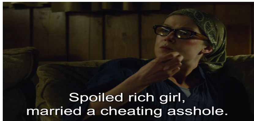
Figure 4. (Social conflict between Amy and Greta)

Greta: “Ha-ha-ha.. Oh, I’d love it just once, someone was like...she was “a real rag”. “Ha-ha-ha. Seem like a rich bitch to me”.