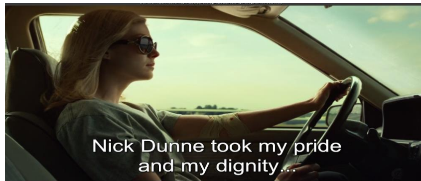
Figure 2. (Social conflict between Amy and Nick) Source: Gone Girl Movie

Figure 2 shows the scene when Amy driving her car and left Nick alone in their house. Amy feels so disappointed with Nick because Nick already cheating on her. She do not have any options to solve her household problems, so she prefer to go outside. But actually, in that moment Amy already prepared her mission to take revenge to Nick. Below is the monologue that expressed Amy's feeling toward Nick after they were fights because Nick wants to divorce Amy and prefers to life with his mistress.