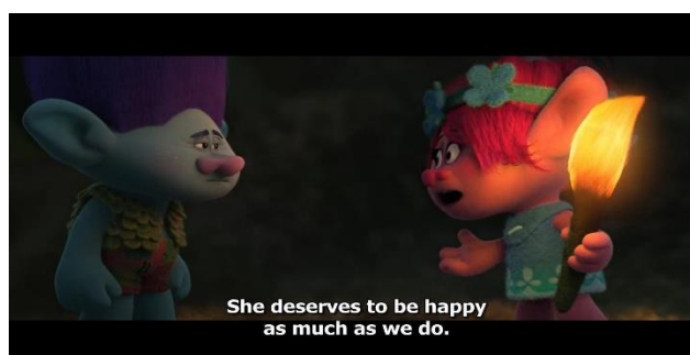
Figure 1. Values of Being

Value of being is a value within human being involved into the behavior and the way we treat others Linda and Eyre (1997:122) . Value of being is also including Bravely, Honest, Respectfulness, Hard Work, National Spirit, Responsibility. Value that comes from your own character. One example data from values of being is Bravely: