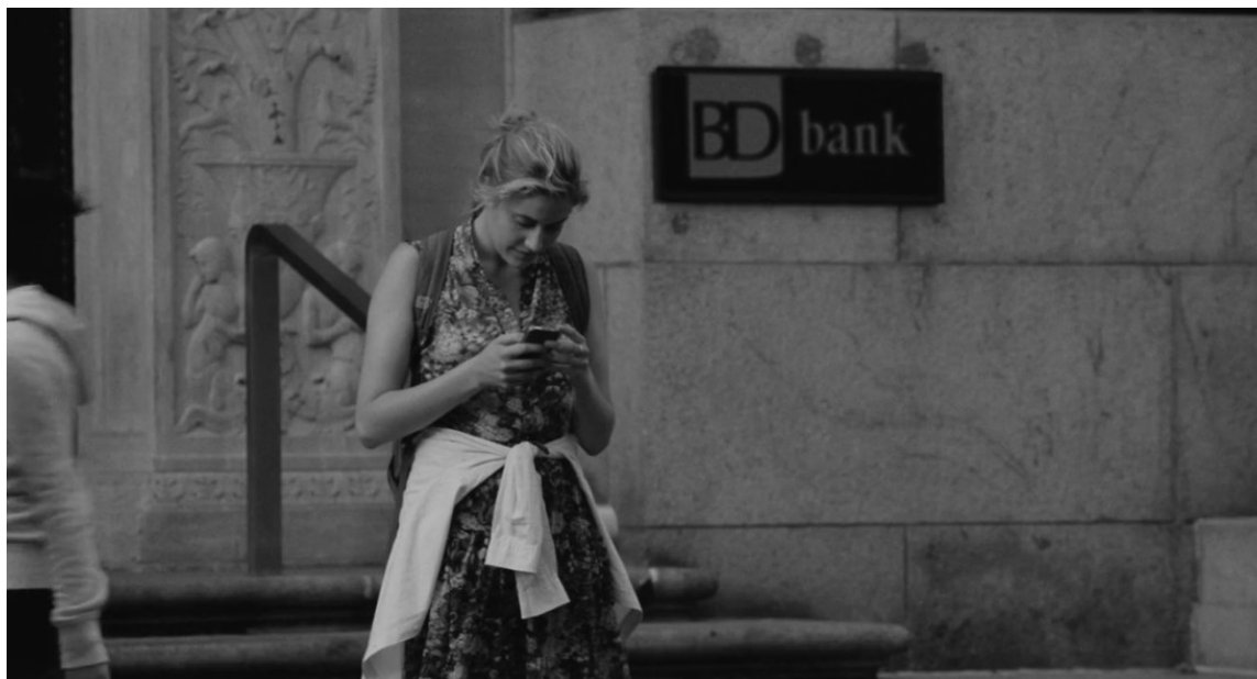
Figure 1. Frances tries to call Lev